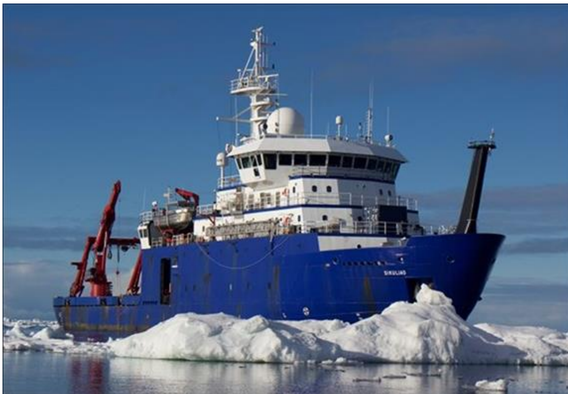
Figure A-6. Sikuliaq