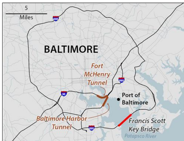
Figure 2. Map of Baltimore Transportation Facilities