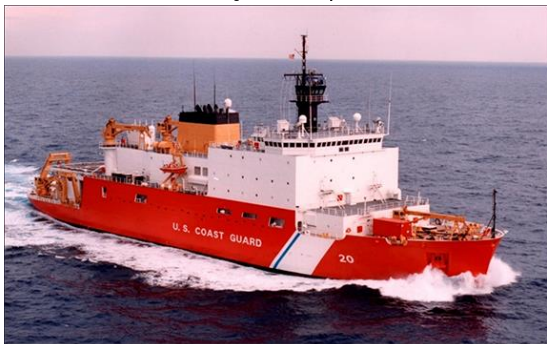
Figure A-3. Healy