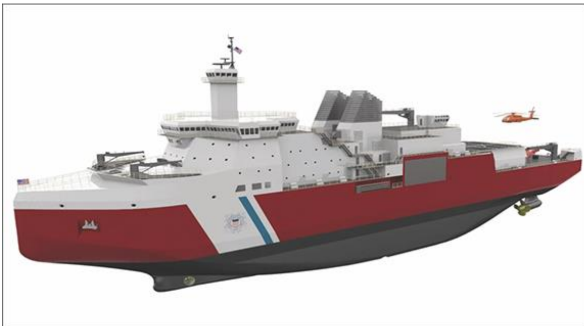
Figure 1. Rendering of Halter Marine Design for PSC

Source: Illustration accompanying Sam LaGrone, “UPDATED: VT Halter Marine to Build New Coast Guard Icebreaker,” USNI News , April 23, 2019, updated April 24, 2019. The caption to the illustration states “An artist’s rendering of VT Halter Marine’s winning bid for the U.S. Coast Guard Polar Security Cutter. VT Halter Marine image used with permission.”