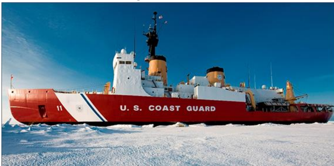
Figure A-2. Polar Sea