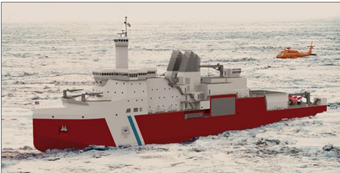
Figure 4. Rendering of Halter Marine Design for PSC

Source: Technology Associates, Inc. (cropped version of rendering posted at http://www.navalarchitects.us/pictures.html , accessed June 10, 2020). A similar image was included in Halter Marine press release, “VT Halter Marine Awarded the USCG Polar Security Cutter,” May 7, 2019, accessed May 8, 2019, at http://www.vthm.com/public/files/20190507.pdf .