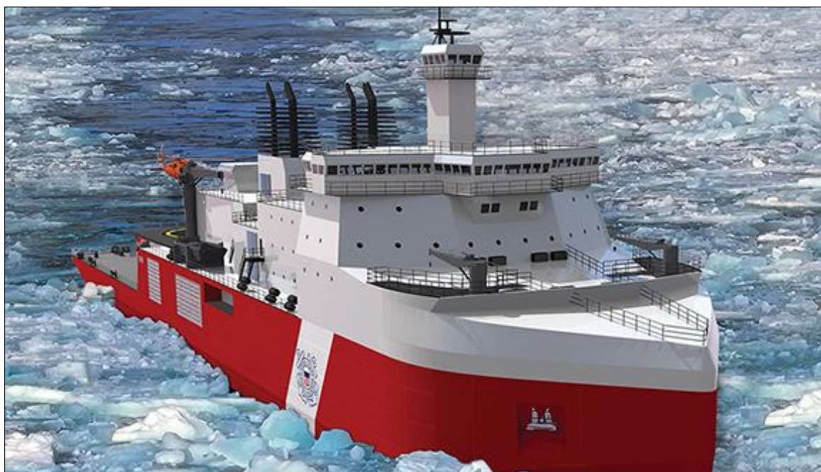
Figure 5. Rendering of Halter Marine Design for PSC