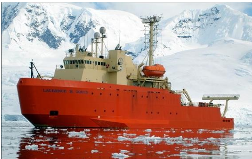
Figure A-5. Laurence M. Gould