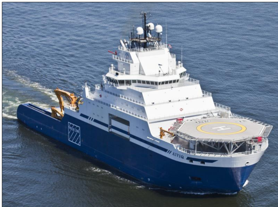
Figure A-7. Commercial Ship Aiviq