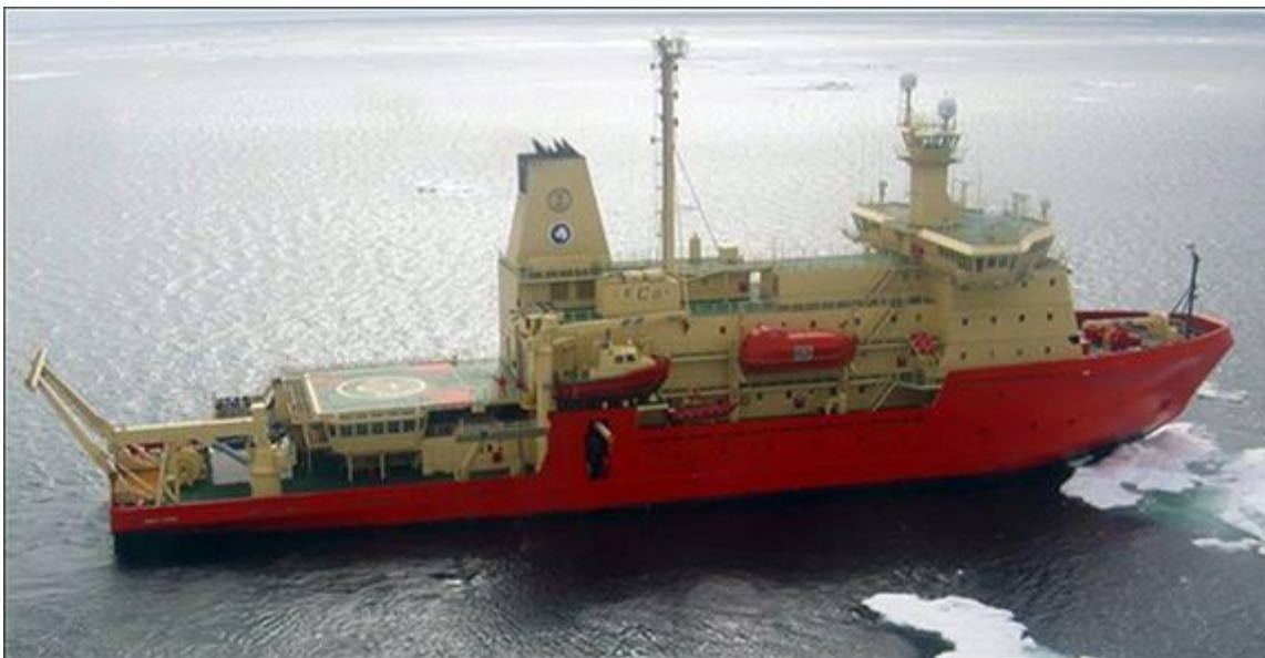
Figure A-4. Nathaniel B. Palmer