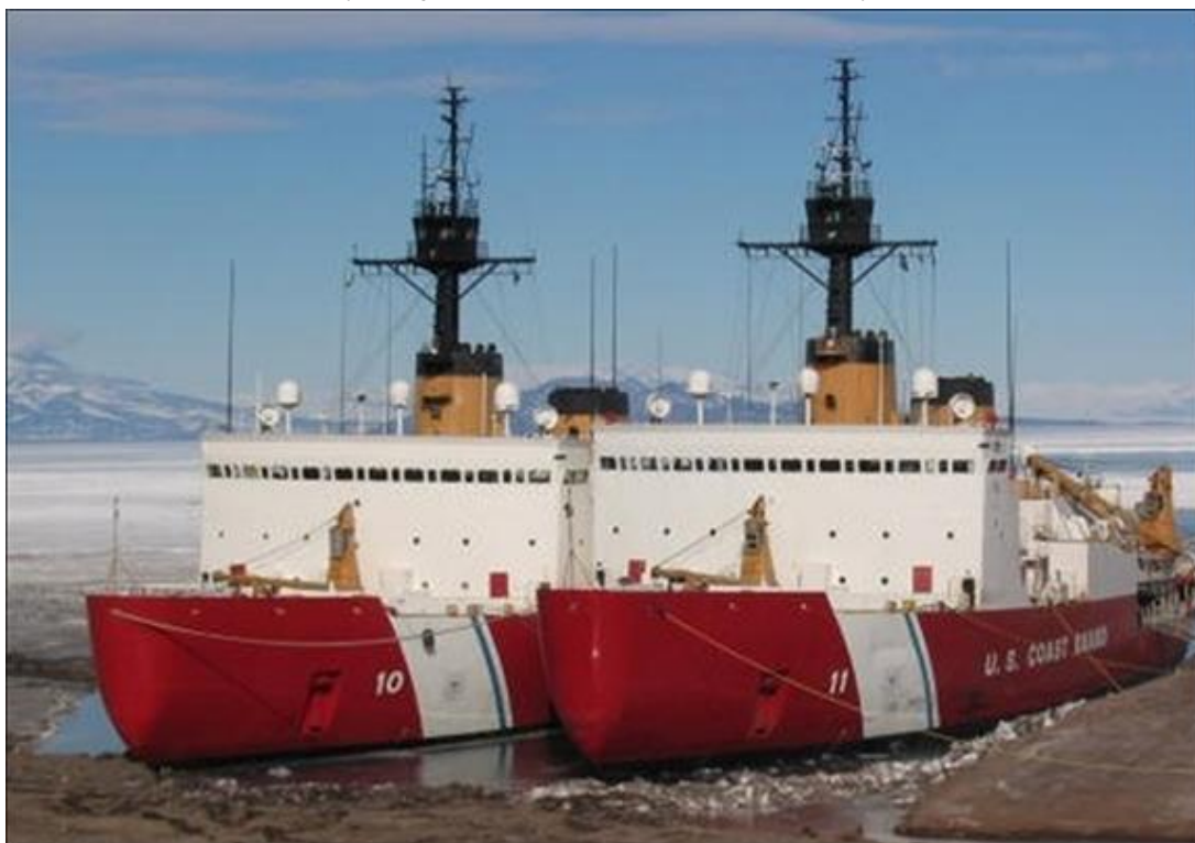
Figure A-1. Polar Star and Polar Sea (Side by side in McMurdo Sound, Antarctica)

Source: Coast Guard photograph that was accessed on April 21, 2011, at http://www.uscg.mil/pacarea/cgcpolarsea/history.asp (link no longer active). The photograph accompanies Kyung M. Song, “Senate Passes Cantwell Measure to Postpone Scrapping of Polar Sea Icebreaker,” Seattle Times , September 22, 2012, posted at http://blogs.seattletimes.com/politicsnorthwest/2012/09/22/senate-passes-cantwell-measure-to-postpone-scrapping-of-polar-sea-icebreaker/ .