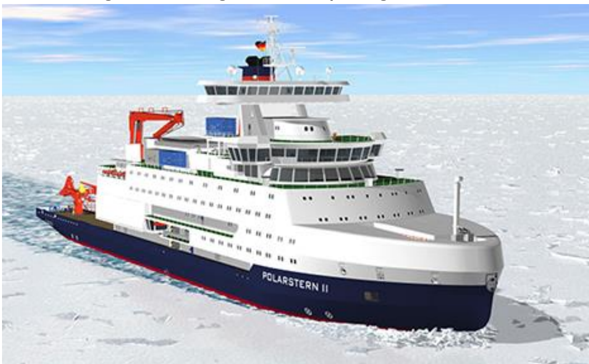
Figure 6. Rendering of SDC Concept Design for Polarstern II