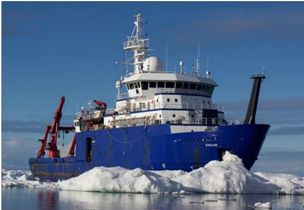
Figure A-6. Sikuliaq