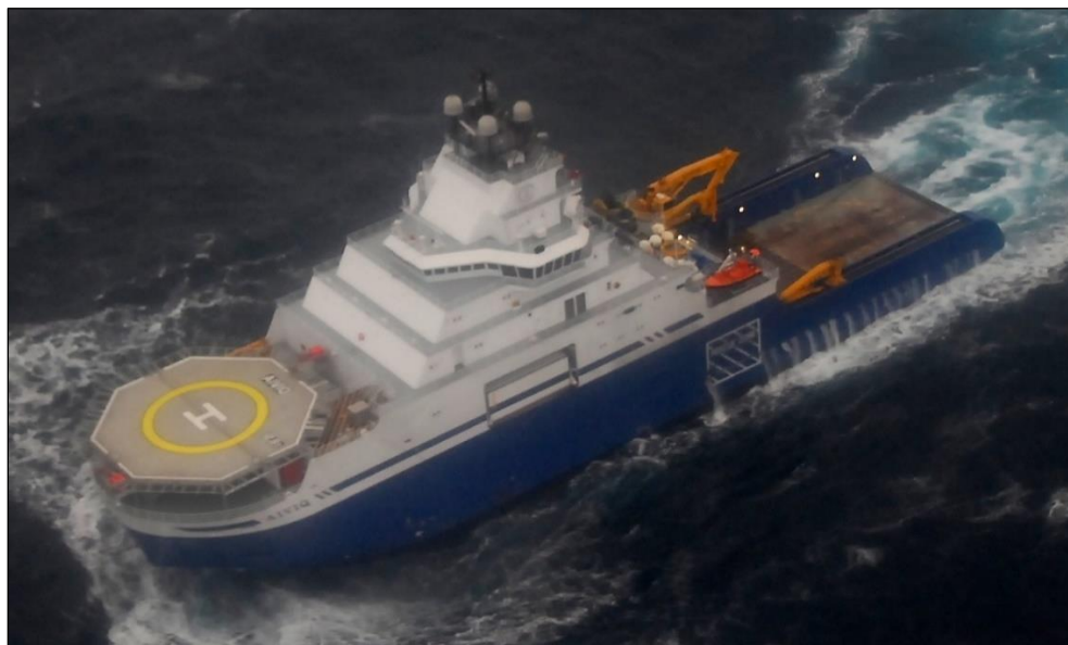
Figure A-8. Commercial Ship Aiviq