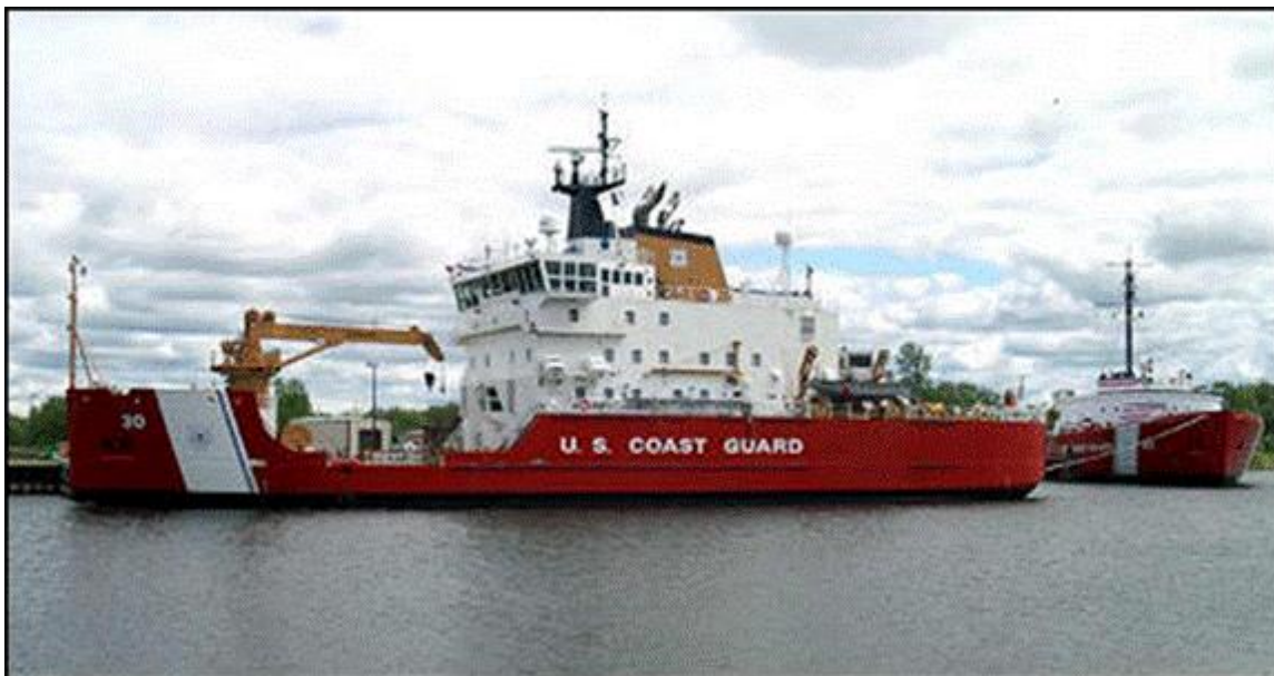
Figure 7. Great Lakes Icebreaker Mackinaw