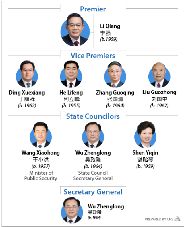
Figure 2. China’s State Council Leadership

Current as of June 28, 2024.